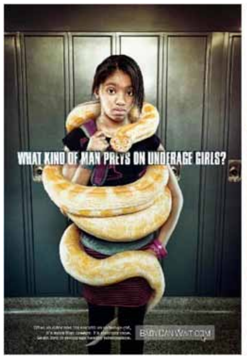
Figure 2: Milwaukee's anti-teen pregnancy campaign

The New York campaign is modelled on a similar initiative in Milwaukee. A 2006 report on the social costs of teen pregnancy found that each child born to a teenage mother cost the state of Wisconsin $80,000 over its lifetime. The report also found that 71% of babies born to teenage mothers were fathered by males over 20 years old. The anti-teen pregnancy advertising campaign subsequently launched also targeted predatory sex with underage girls (Figure 2), and has contributed to a 36% drop in teenage pregnancy in Milwaukee, compared to a 16% drop in the rest of the Wisconsin.<sup>65</sup>