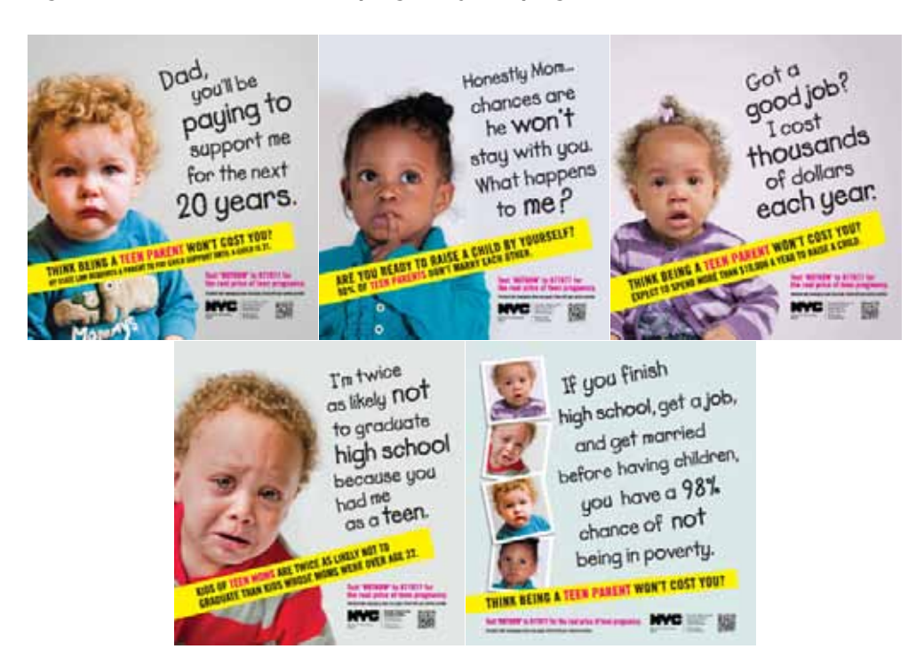
Figure 1: New York's anti-teen pregnancy campaign

The weight of expert opinion in favour of marriage is starting to help shape policy—even in the most 'progressive' states in the union. In March 2012, then city of New York Mayor Michael Bloomberg initiated a citywide public information campaign against teen pregnancy, featuring 4,000 subway and bus shelter ads, plus a range of online and mobile platforms (Figure 1). This attempt to 'send the right message' and 'encourage responsibility' highlighted, among other things, the negative consequences of having a child before marriage, including the financial costs to parents and poor child developmental and life outcomes.<sup>63</sup> Putting aside politically correct concerns about 'stigmatising' unmarried mothers and being 'judgmental,' the campaign set out the 'incontrovertible facts that social science has known for decades but that professors and politicians have not dared inject into the public sphere.'